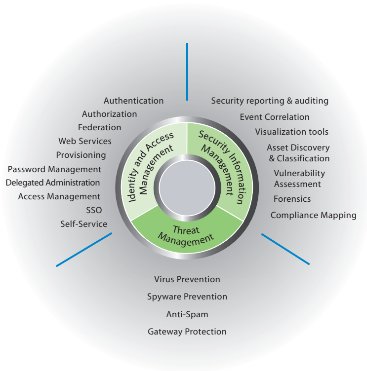
Figure 2. CA Security Management Solutions

CA's Security Management solutions are grouped into three areas: Identity and Access Management, Threat Management, and Security Information Management. These solutions address virtually every aspect of your organization's security, are tightly integrated, and can operate with your existing security infrastructure helping to cut costs and enhance security.